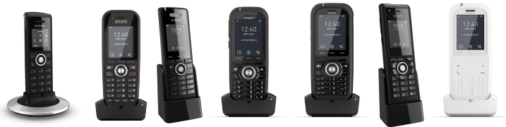
M25 M30 M65 M70 M80 M85 M90