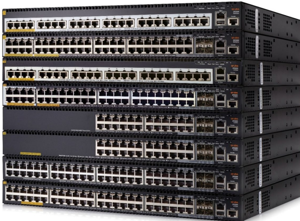
Aruba 2930M Switch Series

The Aruba 2930M Switch Series provides a simple and powerful access layer solution that can be quickly set up at branch offices with little or no IT support using Zero Touch Deployment. The switches include a Limited Lifetime Warranty.